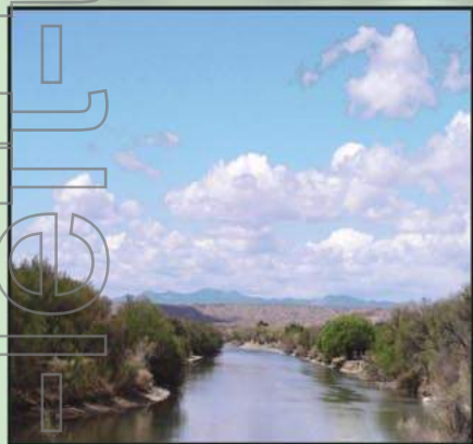
Rio Grande River