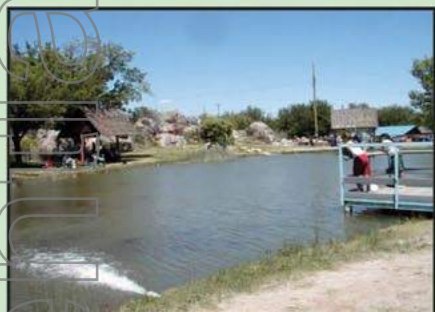
Fish pond at Ralph Edwards Park