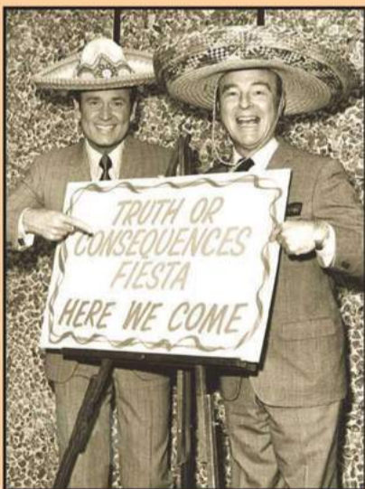
Bob Barker and Ralph Edwards

The final decision was left to the voters of Hot Springs, New Mexico, and on March 31, 1950 the name change was passed 1294 to 295. On April 1, 1950 Hot Springs officially became Truth or Consequences. The first annual Fiesta celebration took place that day as the NBC radio program was broadcast over the country from the Civic Center, now known as the Ralph Edwards Auditorium.