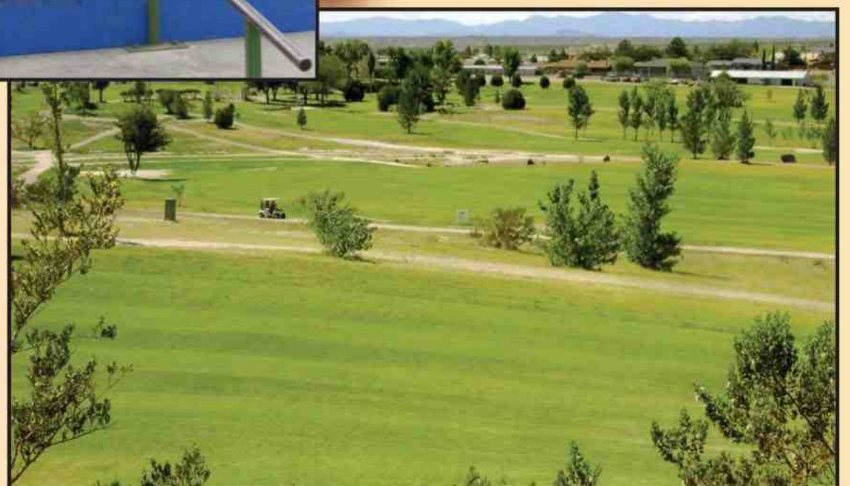
Sierra County offers a wide variety of outdoor sports and activities